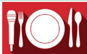
CATHOLIC MEN'S LUNCHEON CLUB

“From the Chair” will air on Tuesday, October 3rd, from 5:00 to 6:00 p.m. on St. Gabriel Catholic Radio AM 820. The Bishop will take your questions during our LIVE monthly call-in show. Call St. Gabriel Catholic Radio at 614-459-4820 to ask your question about the Catholic Faith and growing in holiness.