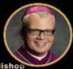
Bishop Donald J. HYING