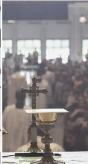
April 2nd Mission of the Church Mass