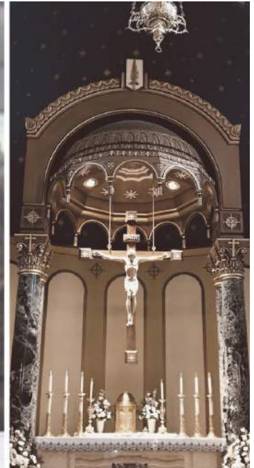
April 3rd Living as Disciples Parish Social