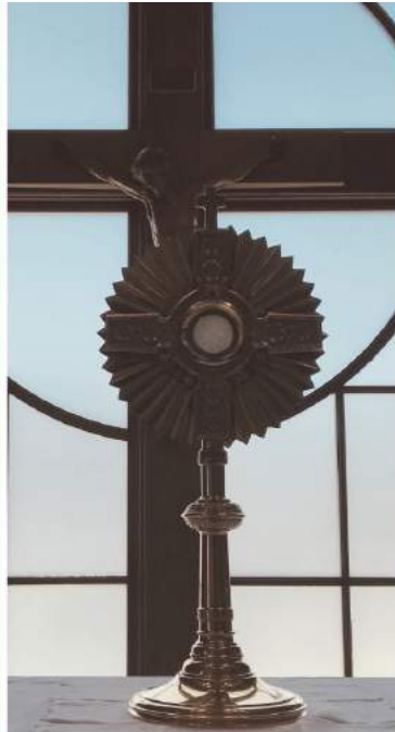
April 1st Meeting Christ Adoration with Confession