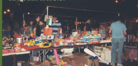
Garage Sale circa 2014

QUESTIONS? CONTACT SVDP@SAINTMICHAEL-CD.ORG OR CALL 614-885-7814 EXT 550