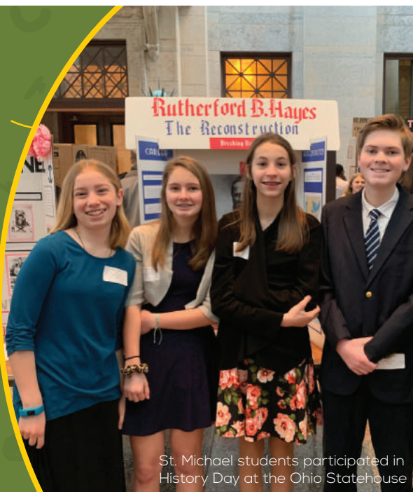
St. Michael students participated in History Day at the Ohio Statehouse

Call or email today! 814. 885. 3149 - contactsms@cdeducation.org Apply at www.stmichaelworthington.org