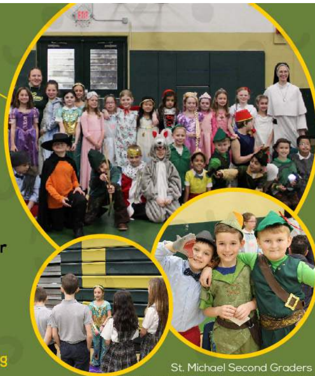
St. Michael Second Graders presenting their Fairy Tales in the Round!

Call or email today! 614. 885. 3149 - contactsms@cddeducation.org Apply at www.stmichaelworthington.org