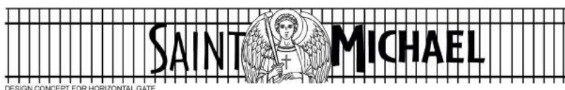
DESIGN CONCEPT FOR HORIZONTAL GATE