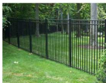
6'-0" BLACK WROUGHT IRON FENCE REFERENCE IMAGE