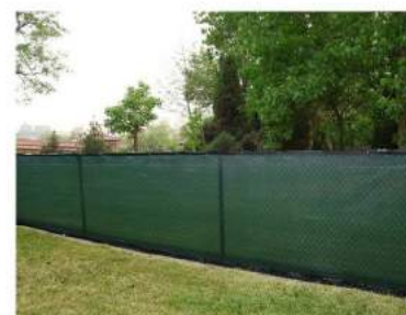
HUNTER GREEN SEMI-TRANSPARENT WIND SCREEN REFERENCE IMAGE