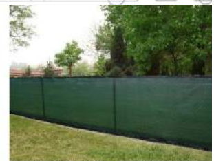
HUNTER GREEN 30M TRANSPARENT WIND SCREEN REFERENCE IMAGE