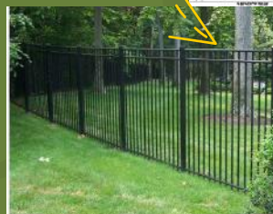
6'-0" BLACK WROUGHT IRON FENCE REFERENCE IMAGE