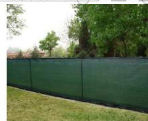
HUNTER GREEN 33M TRANSPARENT WIND SCREEN REFERENCE IMAGE