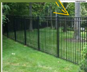
4'-0" BLACK WROUGHT IRON FENCE REFERENCE IMAGE