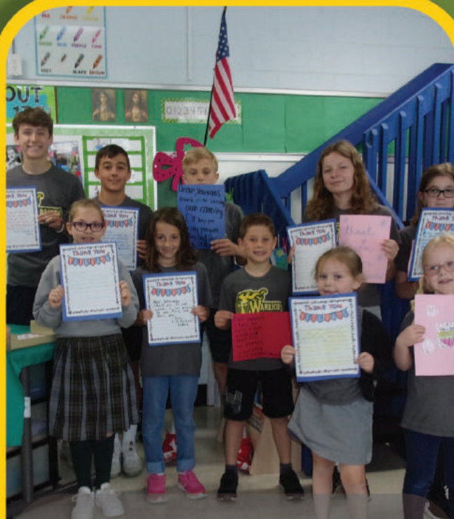
Students teamed up on Family Day for "Operation Honor Flight Mail Call." They made thank you letters for 90 local veterans going on the June Honor Flight from Columbus.

Call or email today to schedule a tour of the school! 614.885.3149 - contactsms@cdeducation.org Apply at www.stmichaelworthington.org