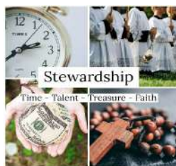
Stewardship Time - Talent - Treasure - Faith

Daily and Sunday Mass intentions are currently available to schedule through August 2023. If you would like to remember a loved one in this way, please visit the parish office to schedule or call for more details. One should never forget the infinite graces that flow from the Sacrifice of the Mass which benefit one's soul, both for the living and the deceased.