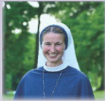
ST. MARY GRACE