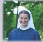
ST. MARY GRACE